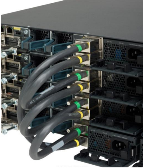
Figure 3. StackPower Connector

StackPower can be deployed in either power sharing mode or redundancy mode. In power sharing mode, the power of all the power supplies in the stack is aggregated and distributed among the switches in the stack. In redundant mode, when the total power budget of the stack is calculated, the wattage of the largest power supply is not included. That power is held in reserve and used to maintain power to switches and attached devices when one power supply fails, enabling the network to operate without interruption. Following the failure of one power supply, the StackPower mode becomes power sharing.