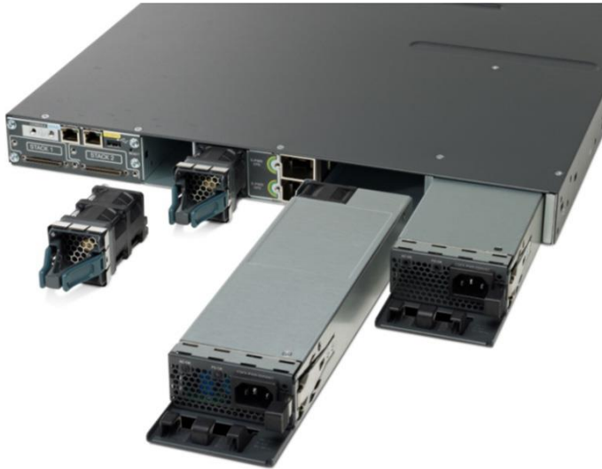
Figure 5. Dual Redundant Power Supplies

Table 6 shows the different power supplies available in these switches and available PoE power.