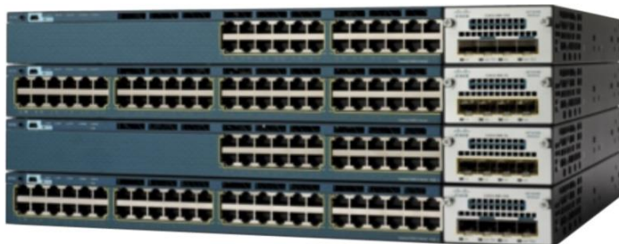
Figure 2. Cisco Catalyst 3560-X Series Switches

Table 2 shows the Cisco Catalyst 3560-X Series configurations.